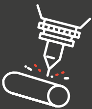
Tube Laser Cutting

We are renowned for our ability to combine an extensive stock range with a wide portfolio of processing services to provide valuable one stop solutions to our customers. Our in-house processing expertise includes: