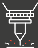
Flat Bed Laser